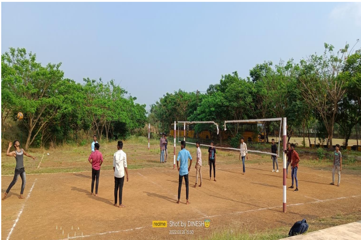
Students playing volleyball Game